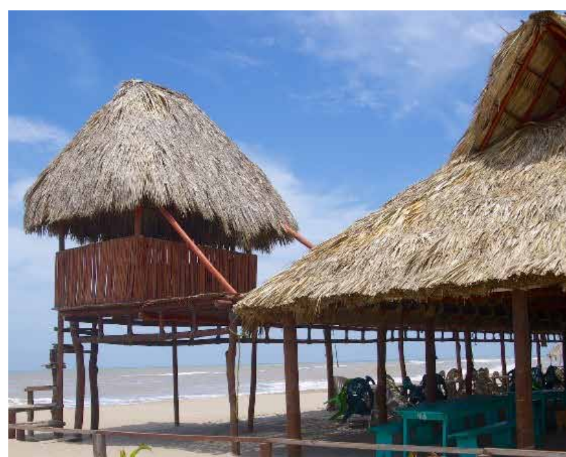
Barra Vieja beach

To 6,6 km from the hotel. 🚗 26 min 🚶 22 min