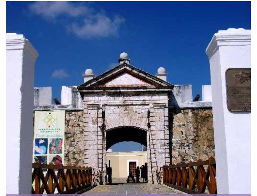
Museum Fuerte de San Diego

To 3,7 km from the hotel. 🚗 18 min 🚶 47 min