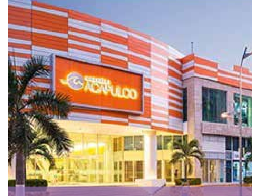
Mall center Galerías Acapulco

To 700 m from the hotel. 🚗 3 min 🚶 5 min