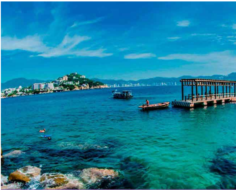
Isla la Roqueta