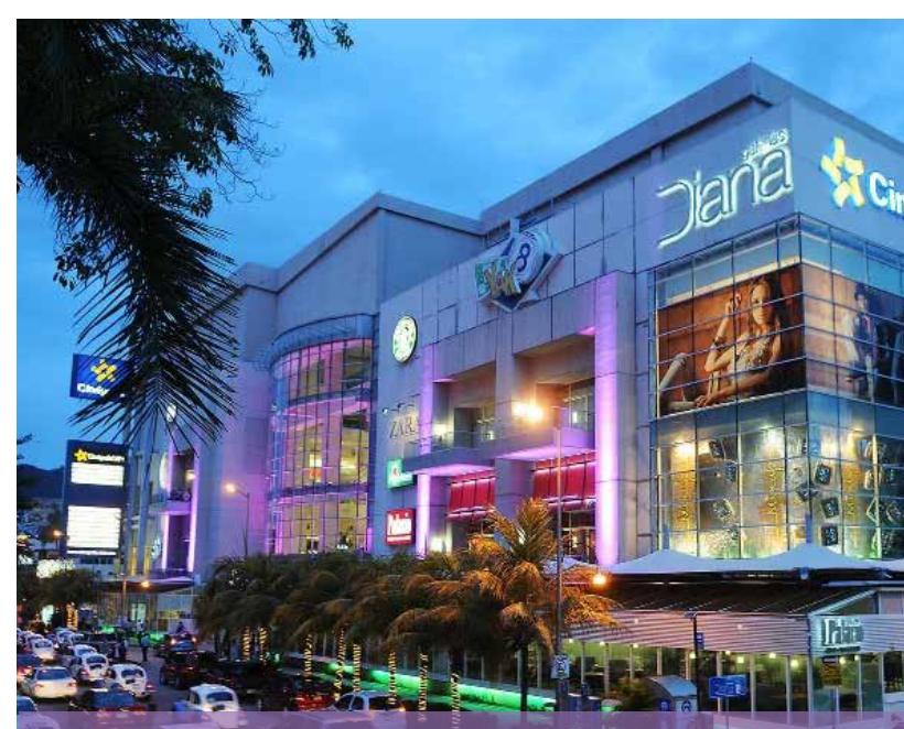
Mall center Galerías Diana

To 700 m from the hotel. 🚗 3 min 🚶 5 min