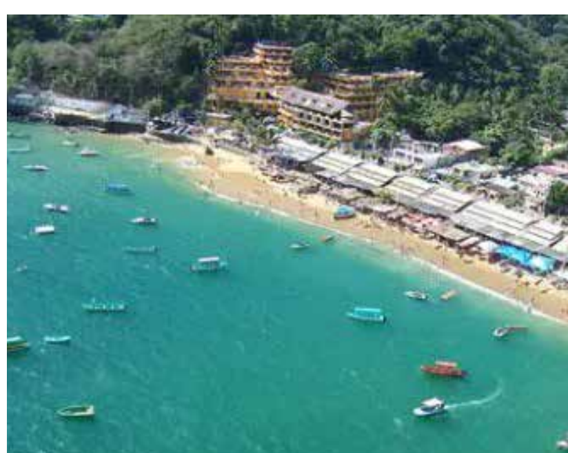
Puerto Marquez beach

To 550 km from the hotel. 🚗 2 min 🚶 7 min