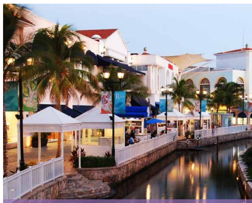
Mall center La Isla

To 3,7 km from the hotel. 🚗 18 min 🚶 47 min